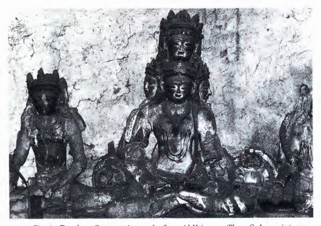
Fig. 4 - Temple at Gumrang, image of a Sarvavid Vairocana.