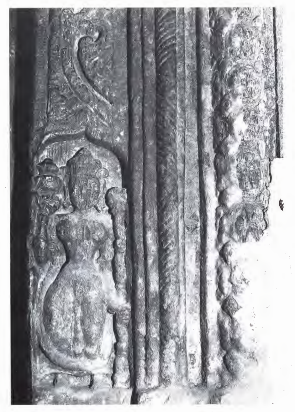
Fig. 8 - Temple at Gumrang, a detail of the door-frame.