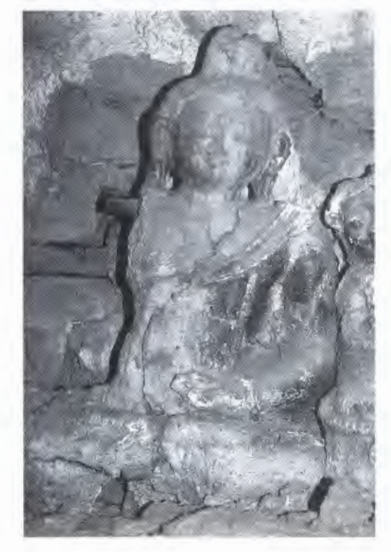
Figs. 5-6 - Temple at Gumrang, a goddess.