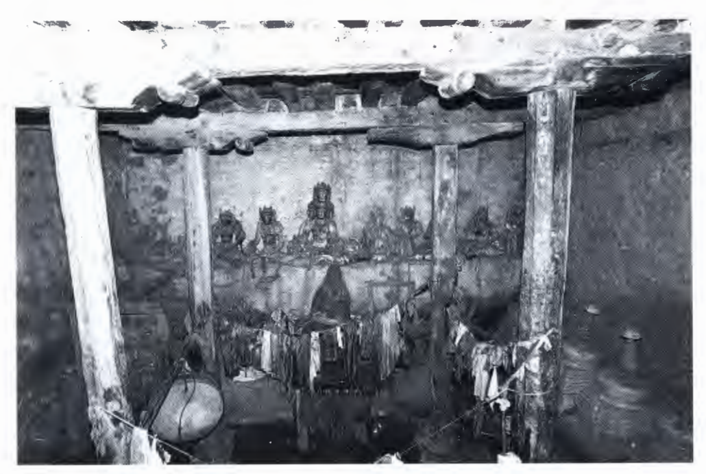
Fig. 3 - Temple at Gumrang, inside view.